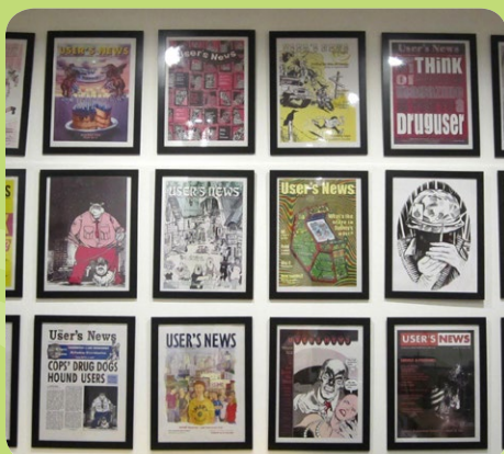
Covers of past NUAA publications of Users News.

NUAA was an integral part of the early unofficial movement to provide sterile injecting equipment to PWID in direct response to the emerging impact of Acquired Immune Deficiency Syndrome (AIDS). At that time, the practice of sharing injecting paraphernalia – particularly needles and syringes – was acknowledged as a major vector for the newly emerging virus. Some twenty five years later (and while we have aided in maintaining low rates of HIV/AIDS among the injecting drug using community) Hepatitis C transmission prevention continues to present inimitable challenges.